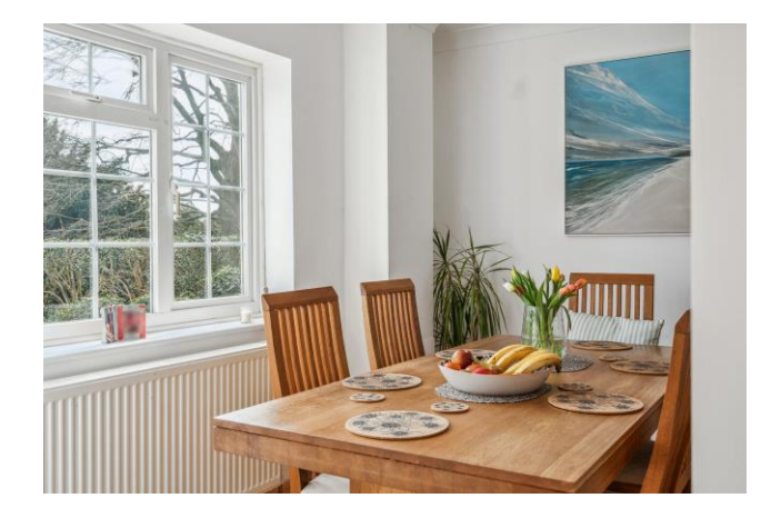
DINING ROOM : a rear aspect room with double glazed window, radiator, wood flooring.

DOUBLE ASPECT SITTING ROOM : with double glazed window to the front with fitted shutters, two radiators, television aerial point, double glazed door and picture windows opening to patio and garden, wood flooring, double doors to