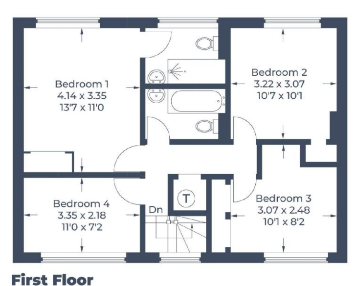
Illustration for identification purposes only, measurements are approximate, not to scale. © CJ Property Marketing Produced for Andrew Milsom